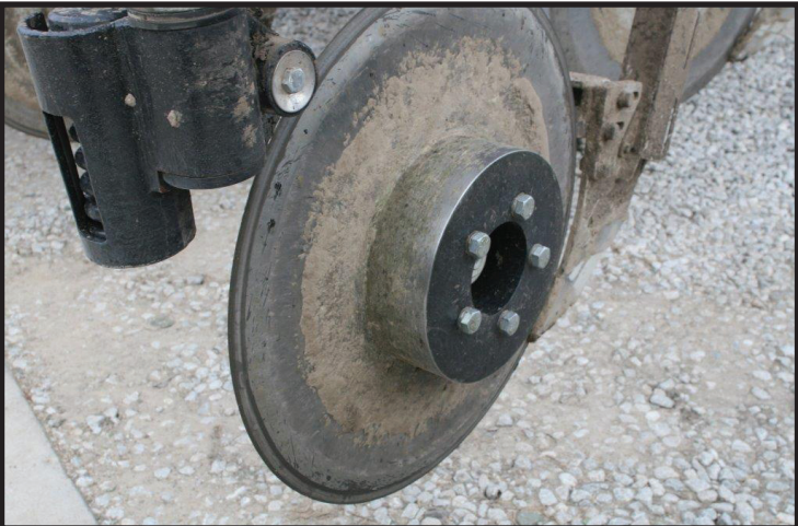
Gyro Counter Weights

P-51 swiveling single disc Mustangs at $1,575 to $4,257, each model meeting the need from 150 pounds each per opener to 450 pound's per opener. P-51A, P-51B, P-51C (shown) and P-51 CUE, Ultra Endurance